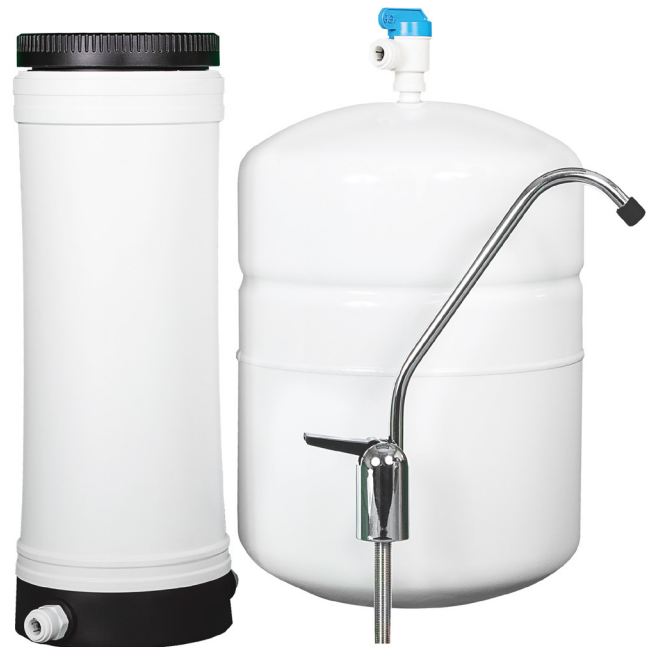
Solo I Reverse Osmosis System